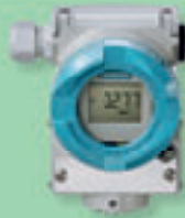
SITRANS P DS III