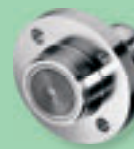
Hygienic connections: Neumo, Bio-Connect and Bio-Connect 5