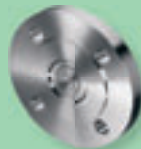
Flange to EN 1092-1 and ASME B16.5