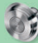
Varivent connections, type N